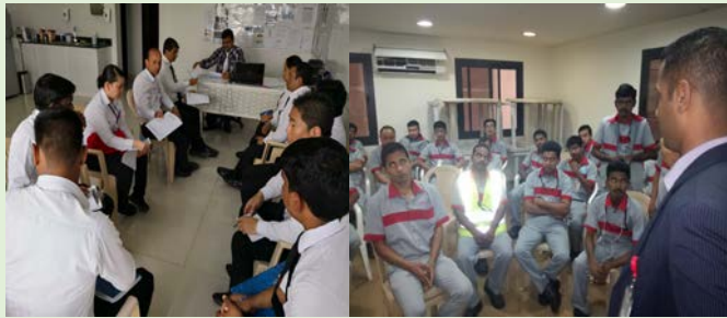
QZS - KHUH

Toolbox Talk Trainings were conducted by Health & Safety officers to various Divisions: Quick Zebra Services, Protect Security Services and Executive FM discussing topic regarding Hot Weather and Effects of Heat.