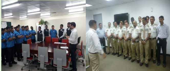
QZS - CCB